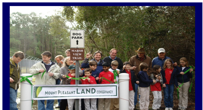
Children from Whitesides Elementary School, and members of Mount Pleasant Town Council, Mount Pleasant Waterworks and the Mount Pleasant Land Conservancy Board cut the ribbon to the new nature trail. Future plans include outdoor teaching opportunities for area schools.

unique Mount Pleasant and East Cooper quality of life. This includes wetlands, upland property, scenic vistas and public spaces such as parks. To find out more about the MPLC and the new Marsh View Trail visit www.mountpland.org .